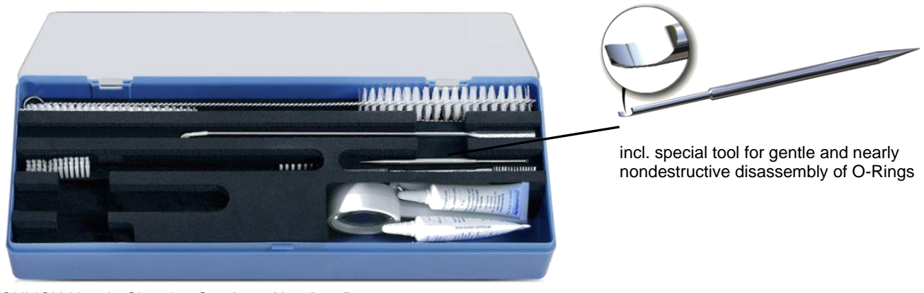
SCHLICK-Nozzle Cleaning Set; Item-Number 53066-2

Lubricant OKS 250; Item-Number 54249 (up to 1400°C / 2550°F)