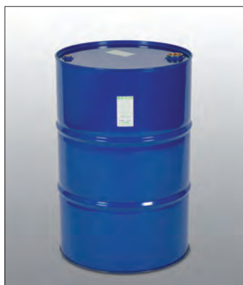
If large quantities are needed ECHOKOR and ECHOKOR LF are also available in 200 l barrels.

Water is an ideal couplant, however, it causes corrosion of test objects and test equipment.