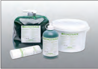
Various package sizes for ECHOTRACE: Indispensable for manual contact testing