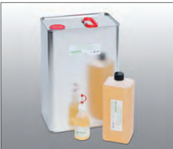
ECHOFLUID is especially suited for higher test frequencies and for wall thickness measurement

The couplant ECHOTRACE is a water-based gel with ideal ultrasonic properties and achieves better acoustic coupling compared to e.g. oil, grease or water. It contains anticorrosives, is dermatologically neutral and non-inflammable.