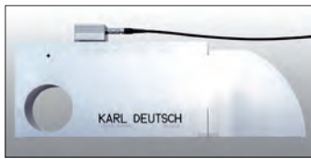
Calibration block no. 1