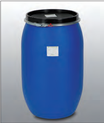
For large quantities barrels of 200 l are provided