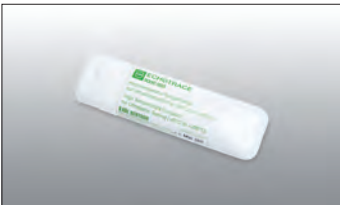
ECHOTRACE high temperature couplant for the inspection on hot surfaces