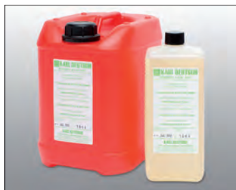
Package examples for ECHOKOR