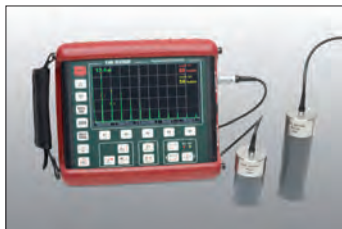
Adjusting standards with echo sequences of 50 mm and 100 mm